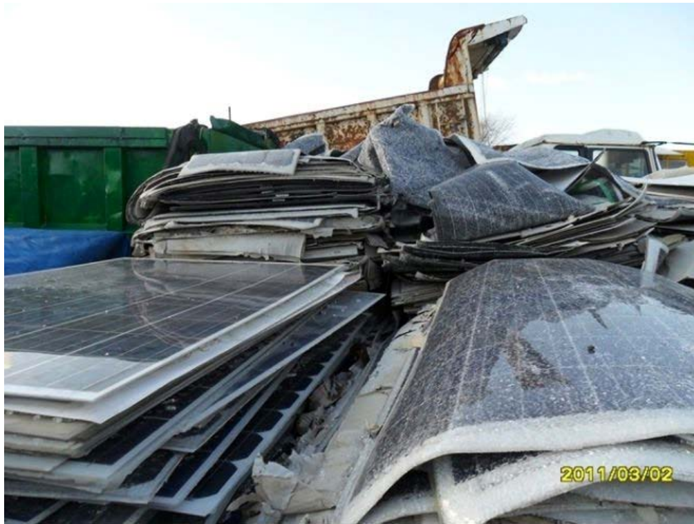
Figure 4: The mangled PV panels in this picture illustrate the nature of broken solar panels; the glass cracks but the panel is still in one piece.

PV panels constructed with the same basic components as modern panels have been installed across the globe for well over thirty years. 3 The long-term durability and performance demonstrated over these decades, as well as the results of accelerated lifetime testing, helped lead to an industry-standard 25-year power production warranty for PV panels. These power warranties warrant a PV panel to produce at least 80% of their original nameplate production after 25 years of use. A recent SolarCity and DNV GL study reported that today's quality PV panels should be expected to reliably and efficiently produce power for thirty-five years. 4