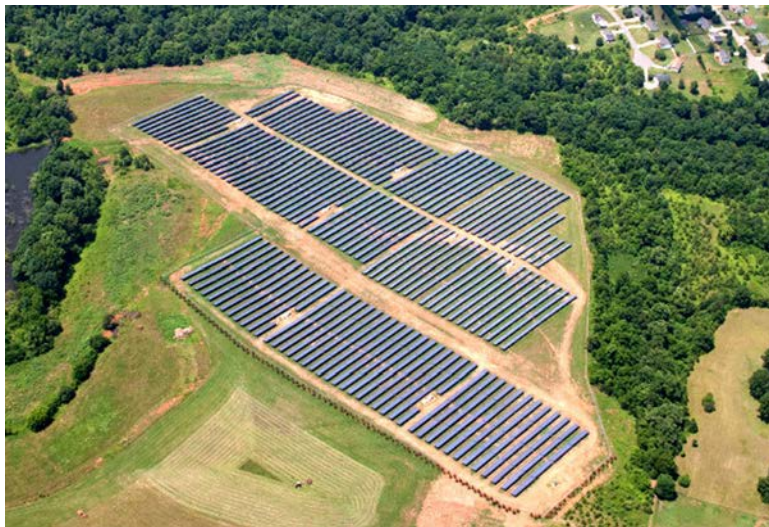
Figure 1: Utility-scale solar facility (5 MW AC ) located in Catawba County.

The system installation, or construction, process does not require toxic chemicals or processes. The site is mechanically cleared of large vegetation, fences are constructed, and the land is surveyed to layout exact installation locations. Trenches for underground wiring are dug and support posts are driven into the ground. The solar panels are bolted to steel and aluminum support structures and wired together. Inverter pads are installed, and an inverter and transformer are installed on each pad. Once everything is connected, the system is tested, and only then turned on.